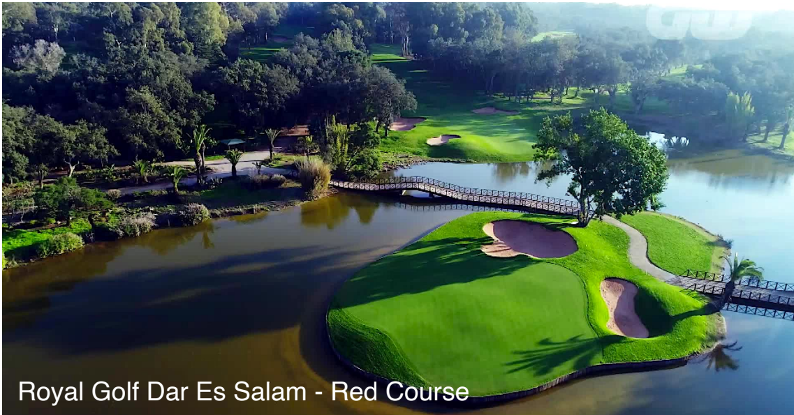
Royal Golf Dar Es Salam - Red Course