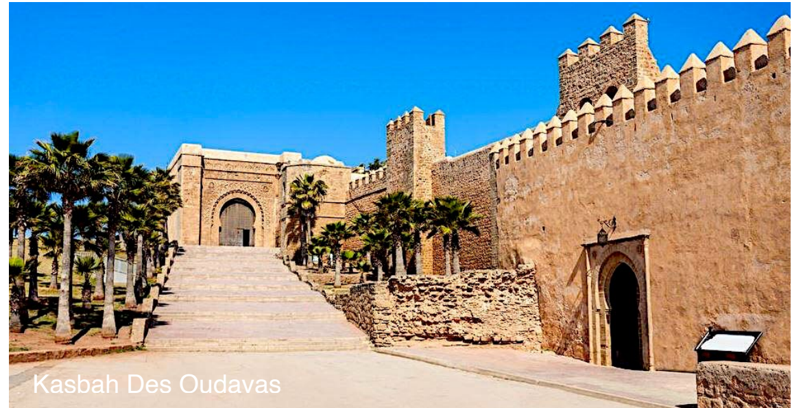
Kasbah Des Oudavas